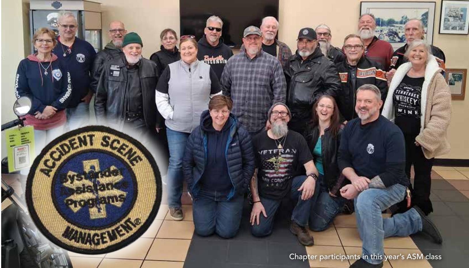
Chapter participants in this year's ASM class